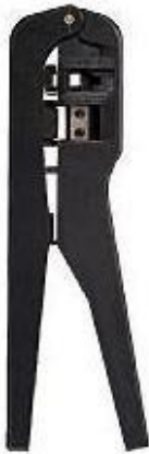
Combination modular strip and crimp tool

The following tools and materials are all you'll need. Part numbers and advertised prices for various suppliers (accurate at the time this app note was written) are also shown.