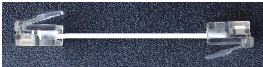
A Modular “ Data ” Cable (side view) (The incorrect cable orientation for use with the CTI network)

For convenience, manufacturers of modular cable provide a visible and tactile marker on the outer cable sheath (usually a raised ridge running the length of the cable). Using this marker as a guide, align the modular plugs so that the spring clips are on the same side at both ends (which side of the cable you choose doesn’t matter).