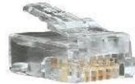
6 position/4 conductor "RJ11" modular crimp plug (2 per cable)