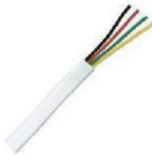
4-conductor modular phone cable